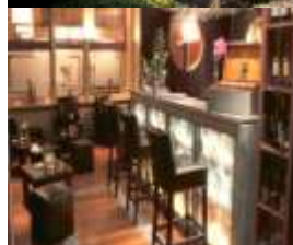
Dijon Chapeau Rouge 4* 30 rooms