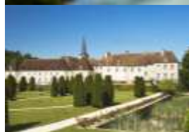
Dijon/Gilly Chateau de Gilly 4* 48 rooms