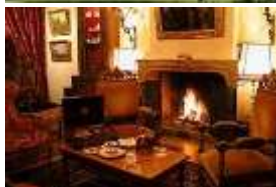
Beaune Hotel Le Cep 4* 64 rooms