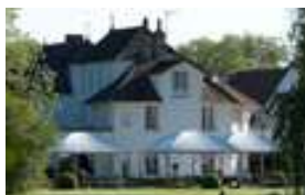
Beaune/Levernois - Hostellerie Levernois 5*, 22 rooms