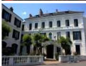
Beaune Hotel de la Poste 4* 36 rooms