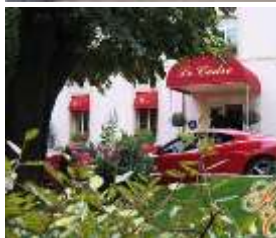
Beaune Hostellerie le Cèdre 4 39 rooms