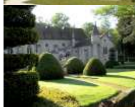
La Bussière Abbaye de la Bussière 4* 18 rooms