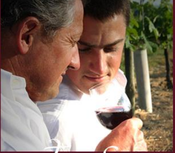
The Secret of Wine...